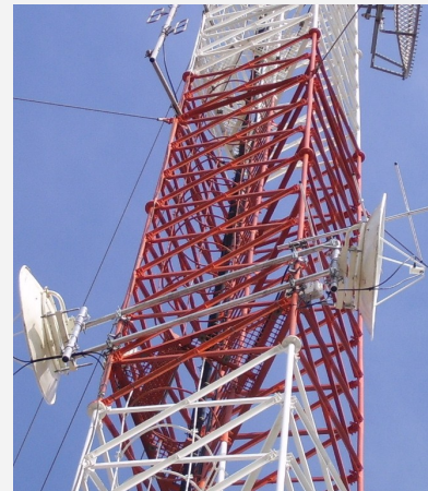
Installation at repeat site— Perdekop