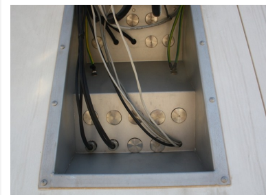
Installed lightning/power surge arrestors