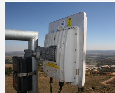
Motorola PTP 600 integrated RF Microwave radio